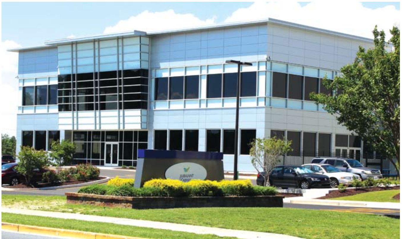
Manufacturing facility at Salisbury, Maryland, USA

Manufacturing Facilities: Salisbury, Maryland, USA | Roorkee, Uttarakhand, India